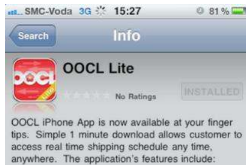
OOCL Lite in App Store

Our new OOCL Lite iPhone App has been released. The App will enable users to access real time sailing schedule information. Schedules can then be saved as favorites, sent via e-mail or sent by SMS. The App is available now from the App Store. The promotional video can be viewed in English on OOCL's YouTube Channel .