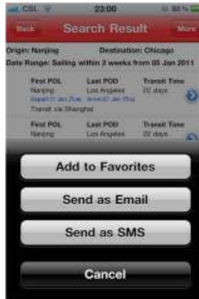
Save or send information

Best Regards, OOCL BENELUX OOCL NETHERLANDS BRANCH